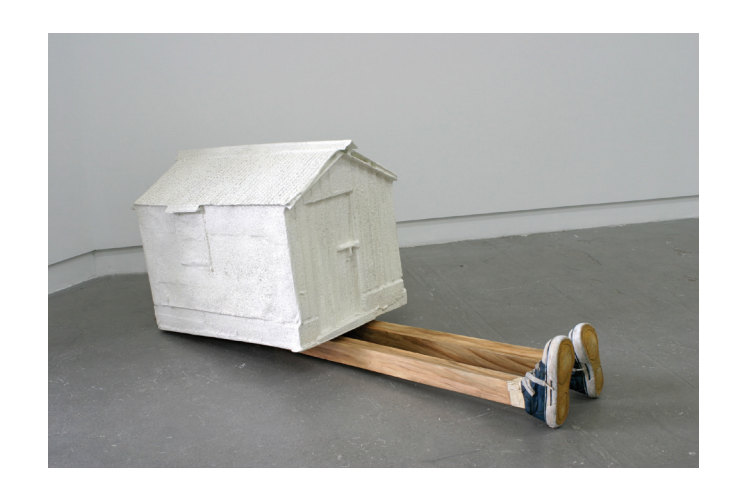
Image above: Ronnie van Hout , Timing That Flawed 2009. Painted resin, 3 pieces: 100 \times 37 \times 46 \text{cm} .

We acknowledge the Wurundjeri people as the traditional custodians of the land.