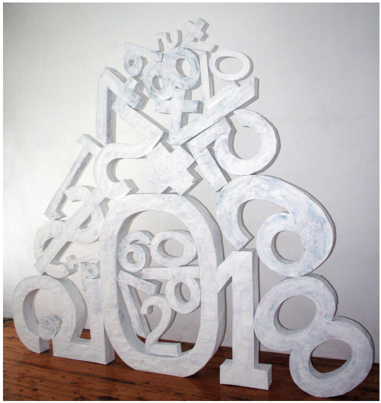
Sadie Chandler Collapsing balance / Creative Accounting 2012 Papier-mâché, acrylic paint dimensions variable

There is a palpable atmosphere here of hope and despair. Ronnie van Hout describes how sheds might be seen as small scale domestic versions of museums. These sheds are based on a version from the artist's familial home. We see protrusions of legs from these structures that are suggestive of the way that homes become an extension of the ego. In Timing that Flawed , the weight of a dwelling has crushed an individual, or maybe it's just a tired shed. In the present context, the work reeks of individual possibilities flattened by pressing financial anxieties.